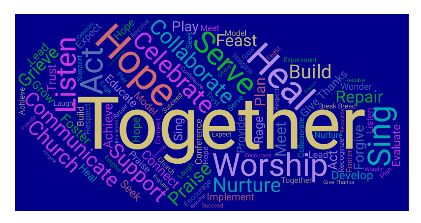
October 5, 2023