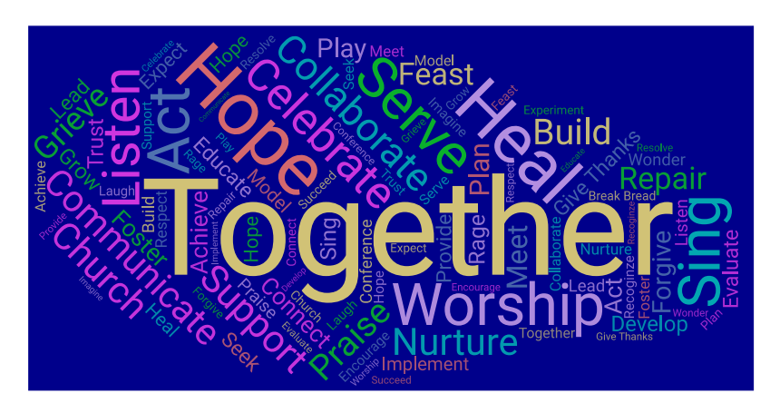
May 12, 2023