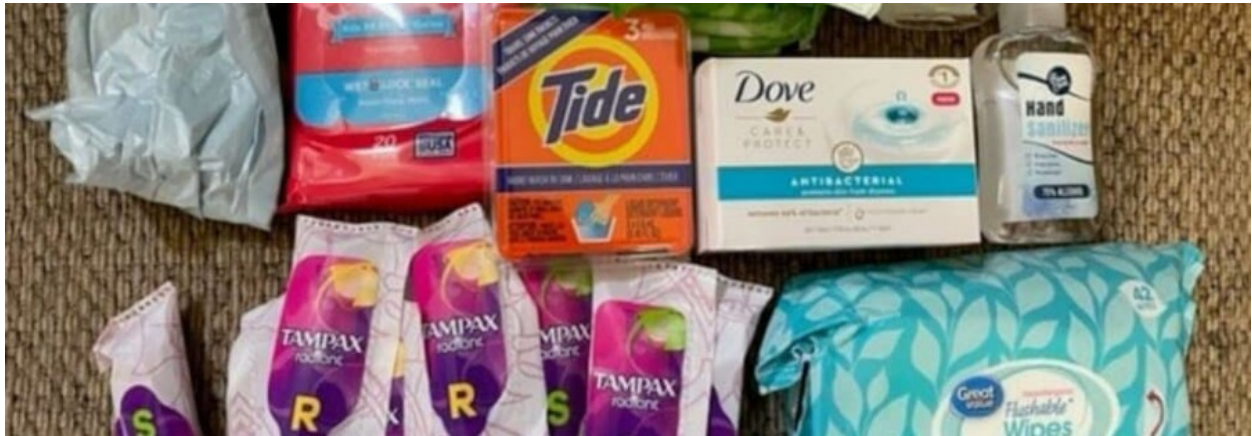
CWS Period Packs (Menstrual Hygiene Kits) Service Project at General Synod 34

In the United States, some people cannot afford menstrual hygiene products such as pads, tampons, and other items that promote healthy practices. This inability to purchase hygiene products is known as period poverty, affecting over 22 million individuals. Church World Service (CWS), a UCC global partner, introduced a Period Pack (Menstrual Hygiene Kit) to help individuals living in period poverty. The kit provides several products that promote cleanliness and health during a menstrual cycle.